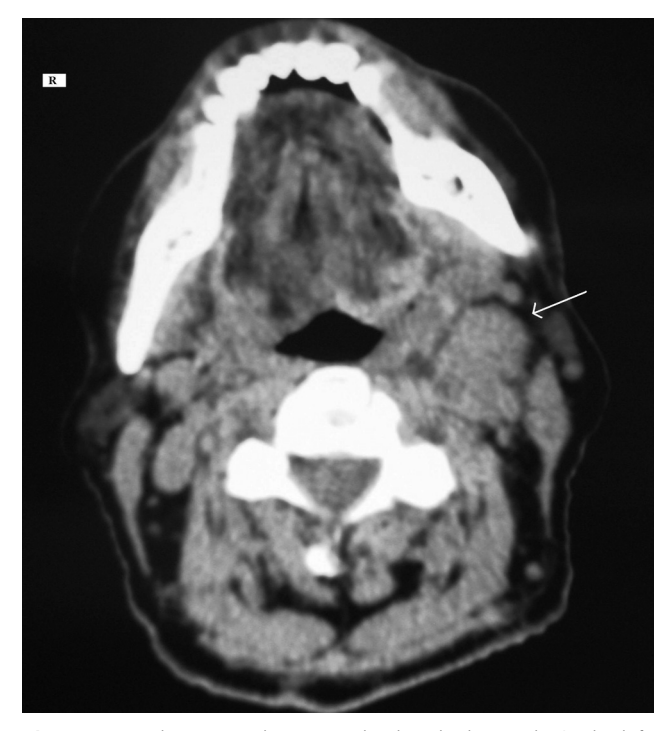
Figure 2 — Neck computed tomography, lymphadenopathy in the left upper cervical region with no abscess (white arrow).

tory of BCG vaccination. F. tularensis tube agglutination test rate was >1/320 (normal range \le 1/160 ) and the final diagnosis was tularemia. The patient was treated with ciprofloxacin