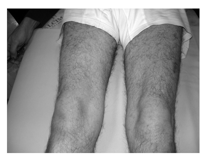
Figure 2— Marked atrophy of left ankle dorsiflexors.

Relevant laboratory data including complete blood count, erythrocyte sedimentation rate (ESR), C-reactive protein (CRP), serum magnesium, calcium, phosphate, AST, ALT, LDH, creatinine and vitamin D levels were normal. Antinuclear antibodies, rheumatoid factor, HIV, hepatitis B and hepatitis C markers were negative. Thyroid function tests, Complements C3, C4 and anti-dsDNA antibody titres were at normal levels. The only abnormal result was the creatinine phosphokinase level of 529 u/l (normal:49-397 u/l). Tests for any possible internal malignancy (chest X-ray, tumour mar-