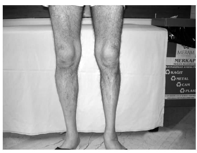
Figure 1— Atrophy of both quadriceps muscles.

He was taking amlodipine besylate 10 mg/day for hypertension. He had no family history of any neuromuscular disease. Clinical examination showed muscle atrophy and weakness of both quadriceps muscles (3/5 on the MRC scale), right deltoid muscles (4/5), left wrist and long finger flexors (3/5). There was marked side-to-side asymmetry between the legs and ankle strength testing revealed severe loss of dorsiflexion strength on the left side (2/5) (Figure 1, 2). Facial muscles were intact. He had no sensory abnormalities. Deep tendon reflexes were absent at the knees. There was no history of difficulty on swallowing.