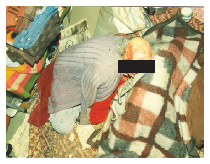
Figure 1— Appearance of the corpse in the sitting erect position in the middle of the room.

External physical examination of the head, face, and neck of the corpse demonstrated a scarce amount of soft tissue only on the lower part of her left cheek, back of her neck, and partially on the right side of her neck. Soft tissues of the head, big part of neck, right arm, both forearm and both hand regions were not detected at the external physical examination of the corpse. Loose skin tags on her neck, right armpit, and left elbow demonstrated indentations resembling dentition peculiar to rats, without any vital signs.