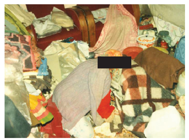
Figure 1— Appearance of one foldout couch, two armchairs, and blankets, old clothes, rug, saucepan, plates on the furniture and the floor.

A n unmarried elderly woman who was living alone thanks to the financial and social support of her nephews and her neighbors. She was found dead in her home. Her corpse was in the sitting erect position in the middle of the scattered room. (Figure 1-2). Statements of the witnesses revealed that the deceased was 75- 80 years of age without any financial income or social security, and she had been seen alive 10- 20 days before. At that time she had a high fever and a bad cough, but refused to get medical aid.