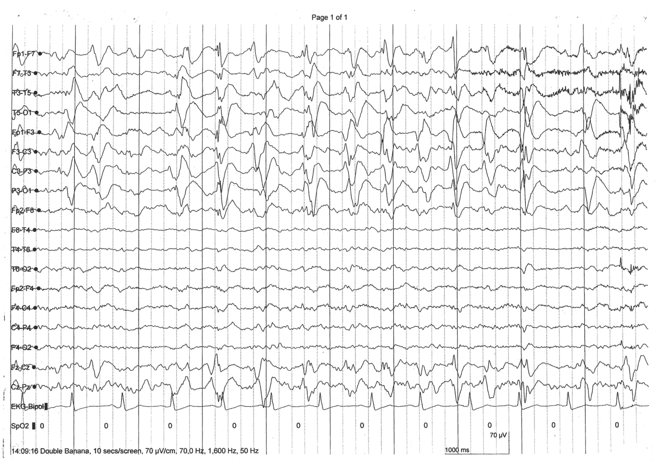
Figure 2— Periodic lateralized epileptiform discharges seen in the left hemisphere and the central areas during the administration of the midazolam infusion.

the lowered seizure threshold, hyperglycaemia likely provoked NCSE on the fifth day, without any obvious electrolyte abnormalities. Furthermore, the patient was taking ciprofloxacin, which is known to lower the seizure threshold.