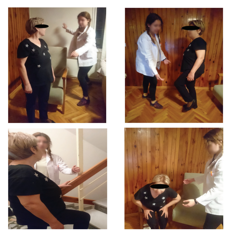
Figure 2. Balance trainings under dual task performance of one of the participants.

°: Paired Sample t Test; <sup>b</sup>: Independent T Test; BBS score min-mix values: 0-56