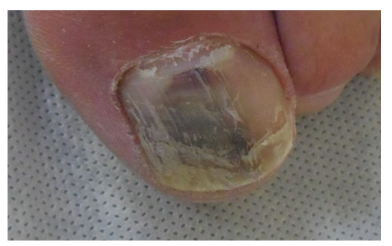
Figure 2 — Onychoschizia and subungual hematoma on the big toenail of a 71-year-old male patient.