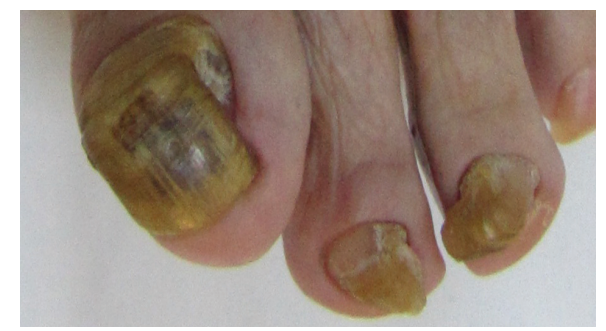
Figure 3 — Onychogryphosis on the 1st, 2<sup>nd</sup> and 3<sup>rd</sup> toenails of a 75-year-old female patient.