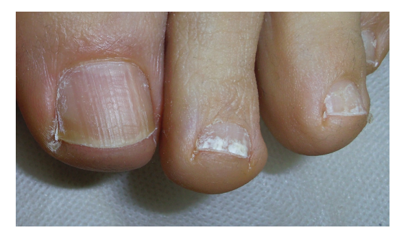
Figure 1— Onychorrhexis on the toenail and superficial white onychomycosis on the second nail of 67-year-old male patient.

Atticipated in the study. The age range was 65 to 97 years and the mean age was 70.19±6.56 years. Patients'clinical and demographic data are summarized in Table 1. The most frequent nail color changes were lunula loss at 77.9% and dull nail at 41.7%. The most frequent surface change was brittle nails at 42.1%. The most frequent brittle nails group included onychorrhexis (38.6%) (Figure 1) and onychoschizia