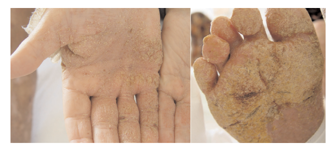
Figure 2— The lesions on the extremities.