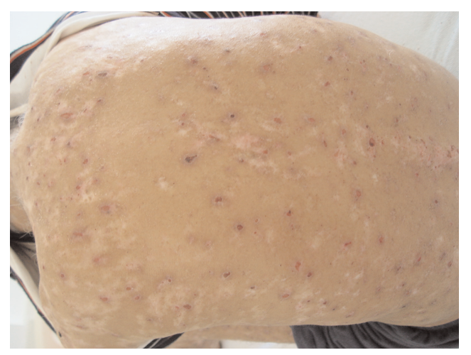
Figure 1— Diffuse lesion on the back.

When a 70-year-old male was an inpatient in the department of internal medicine owing to a diabetic leg ulcer and for management of irregular blood glucose levels, he was consulted to our clinic because of itchy lesions on his trunk, face and extremities, which he had had for 10 years. He had also had hypertension, diabetes mellitus type 2, and coronary artery disease for 30 years, and a history of cured tuberculosis. On dermatologic examination, there were widespread erythematous and excoriated papules on his trunk and other parts of his body, along with hyperpigmentation due to old lesions (Figure 1). Although the itching was widespread, he had no itching of his hands and feet because of peripheral neuropathy. Intense hyperkeratosis was observed on his palmar regions (Figure 2,3).