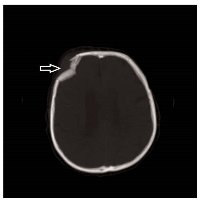
Figure 1- Compression fracture of the frontal bone.

dings related to trauma were observed mostly in the extremities (28%) and head and neck (19%). Table 2 provides a detailed account of the anatomic locatins of traumatic injuries as detected by MDCT. Although this rate was 71.8% in the extremity group (51 of 71 patients), the rate was 48% (96 of 200 patients) for the entire group.